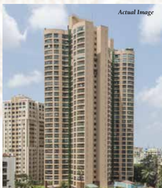
Vishnu Shivam Tower, Kandivali (E)