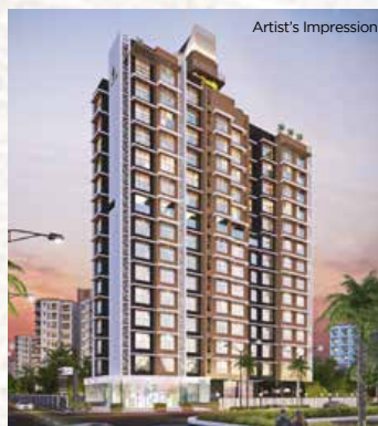
Thakur Aspire, Kandivali (E)