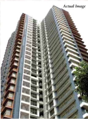
Anmol Fortune, Goregaon (W)

The Capital and Platina at BKC are among our noted commercial projects and The Address-Ghatkopar West, Anmol Fortune -Goregaon West, W54-Matunga West, Solitaire-Powai and Aquaria Grande-Borivali West are some of our well-known residential projects.