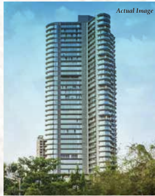
Aquaria Grande, Borivali (W)