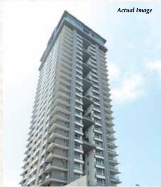
Anmol Pride, Goregaon (W)